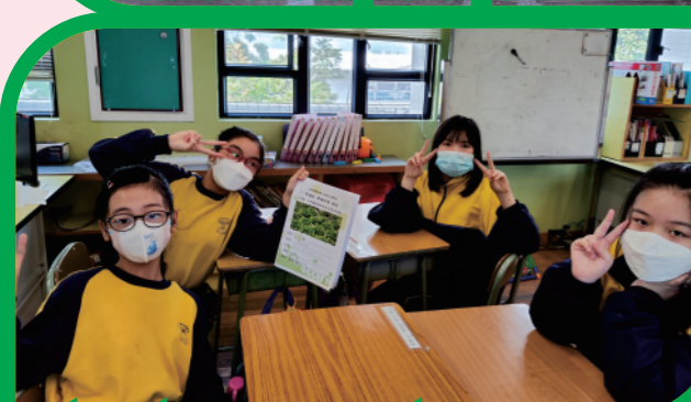
Students organising data for analysis