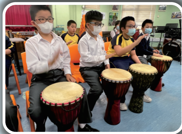
The group playing djembe together! Beautiful drumming from the percussion instrument!