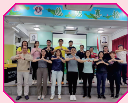
A simple salute carries much of the value of martial arts and virtues

The scheme is in two parts. The first part is "martial arts exercise": 1-2 sets of exercises are devised as universal programmes for the entire school, adopted at both the Physical Education classes and morning assemblies. The second part is "martial arts interest group", where 5-6 martial arts programmes are introduced. This part also concerns the students' understanding of the culture of Chinese martial arts as well as traditional moral virtues, fostering values, life goals, and a sense of belonging to our nation in our students.