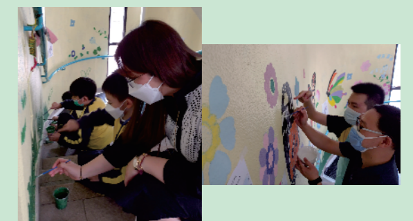
Teaching staff making mural painting