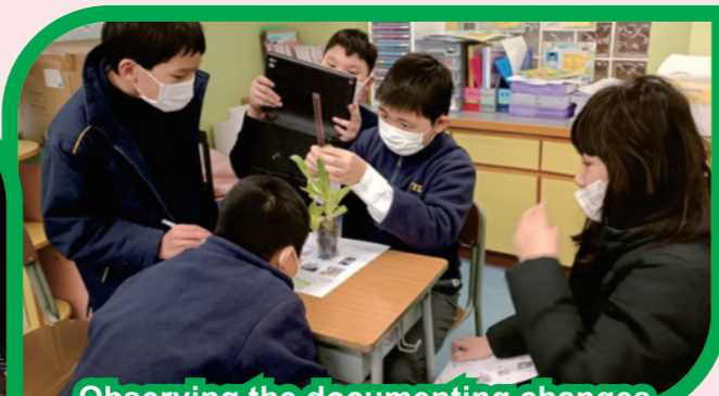
Observing the documenting changes in plants under various experiments