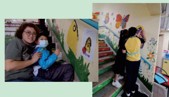
Parent-student group making mural painting