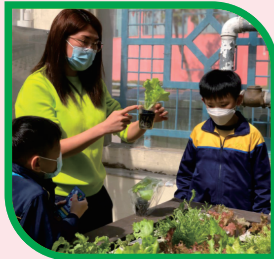
Our teacher guiding students to observe the growth of plants