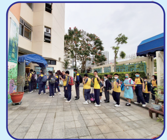
Students look forward to coming back to school every day