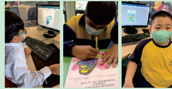
Students were free to choose between traditional mediums or digital software to make their butterfly paintings

Through a vast array of activities and morning assemblies, our students learnt about the growth process of butterflies. Through which they understood the moral and meaning of bravery, courage, and treasuring our lives.