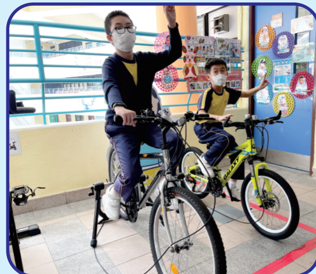
Vitality during recesses