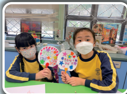
The students create with hearts at Painting Playground!