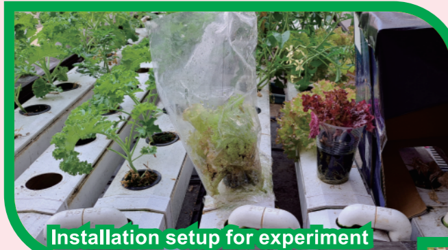
Installation setup for experiment

After the completion of the experiment, the teachers led students to do data analysis, create reports, and rehearse for the presentation. With enthusiasm, students across different classes presented the results of their research.