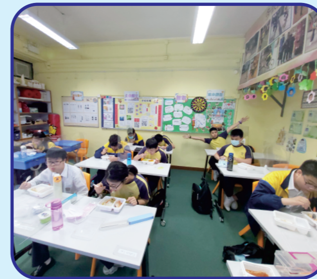
Students can enjoy their lunch again at school

Treasure the journey of learning, and stay mindful of the colourful present.