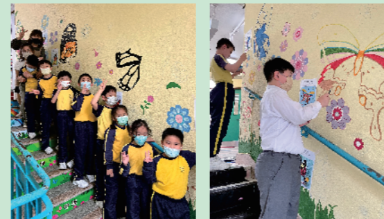
Key Stage 1 students making mural painting