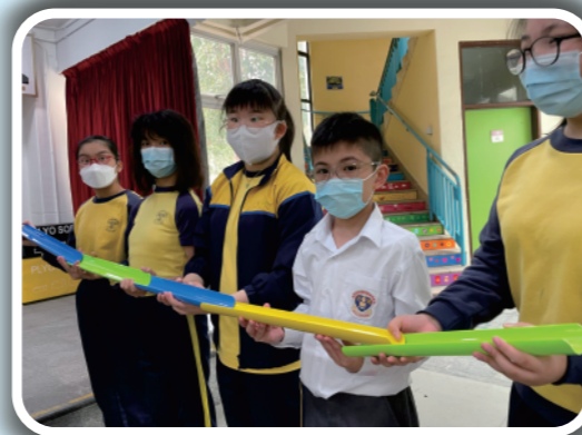
Adventures nurture team spirit; I can do this!