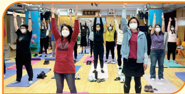
March Positive Education Training: Mental Health and Self-Care