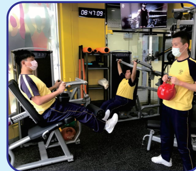
Keeping fit post-pandemic