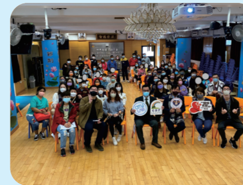
Opening ceremony in February to mark the beginning of the project with Child Development Fund

The school hopes that the 3-year project could run smoothly and successfully, to benefit our students and their respective families.