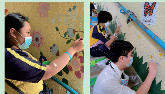
Key Stage 3 students making mural painting