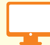
Homepage (web view)