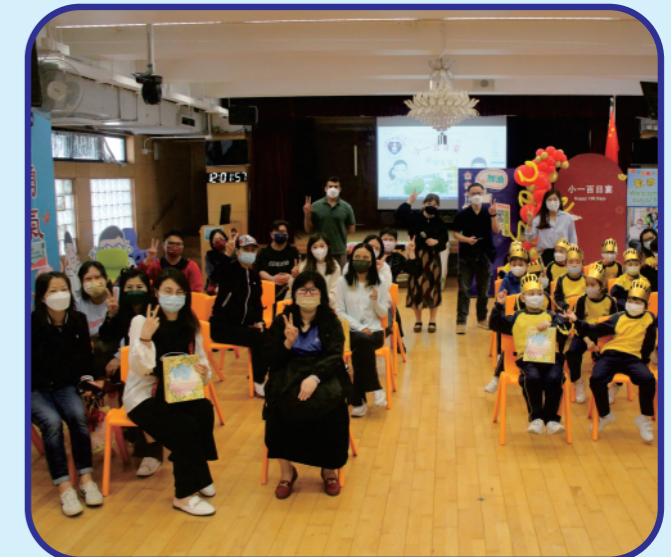
Our P.1 students celebrating their first 100-day at school and looking forward to full-day classes