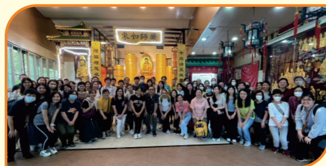
Staff Development Day (3) A visit to To Che Fat She