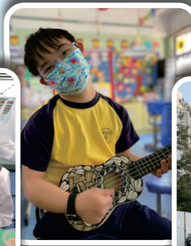
Musical therapy is both moving and nurturing!