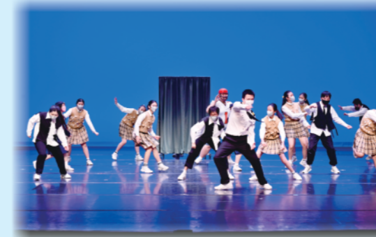
Tacit movements among the highly-skilled ensemble