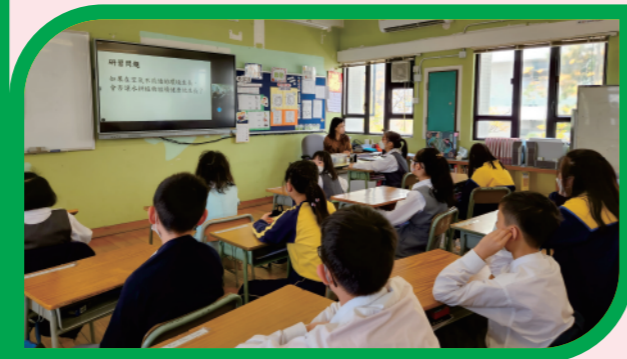
The students and teachers splitting into groups for different research topics

The special project learning can be seen as an extension to last year's hydroponic farming. Our students learnt hydroponic farms as a scientific method to track and monitor a plant's growth, which includes controlling temperature, humidity, and the proportion of plant nutrients using various facilities in the greenhouse. The Key Stage 2 students would also conduct controlled experiments at Yat Lam Hydroponic World and in classrooms, making observations on the correlation between nutrients, air, sun, and the harvest.