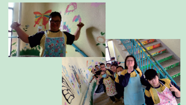
Key Stage 4 students making mural painting