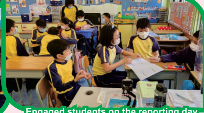
Engaged students on the reporting day