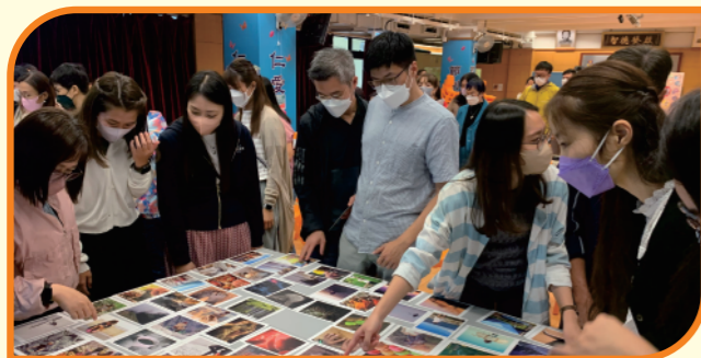
November Positive Education Workshop: Conversation with Emotions

Staff Development Day (3) organised a visit to To Che Fat She, the school sponsoring body. On the same day the team conducted study sessions on National Education and National Security Education, in the hope to bring forth more relevant resources.