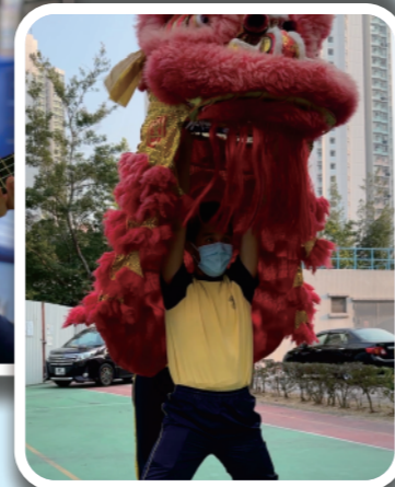
Our dragon-lion dancers ready to show off their skills at Buddha Bathing Ceremony and Sports Day!

With a more relaxed set of covid policies comes the return of after-school activities. A vast array of activities are offered to students according to their diverse potentials and needs. Currently, we have two types of after-school activities; specialised and non-specialised ones.