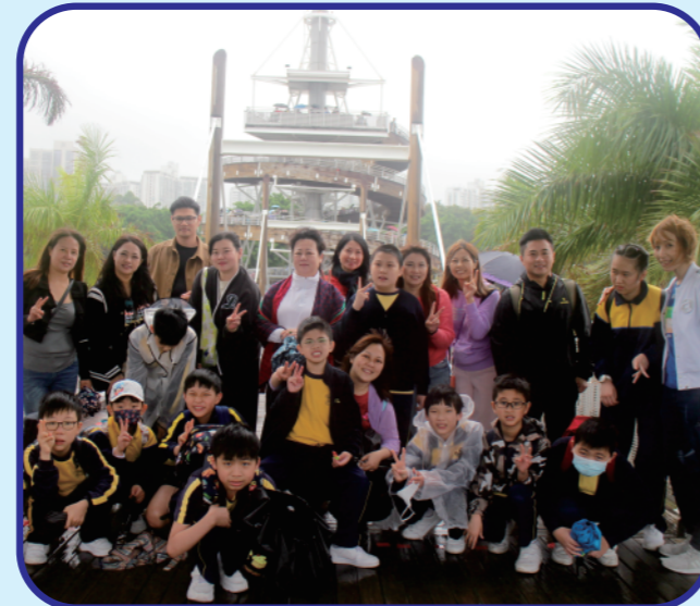
School picnic at long last