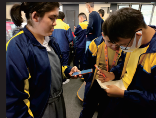
Team members documenting and analysis the racing speed