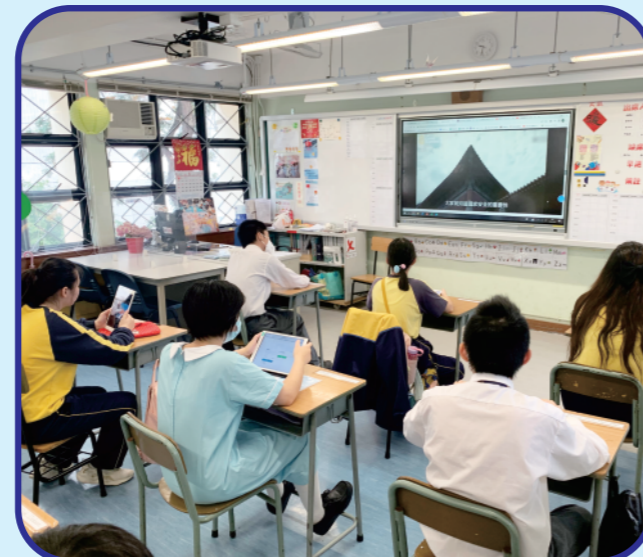
Vivid classroom in the afternoon