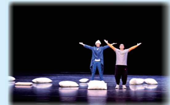
Our two award-winning students with their well-coordinated movements and vivid expressions