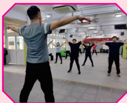
Our high-spirited teachers learning "martial arts exercise"