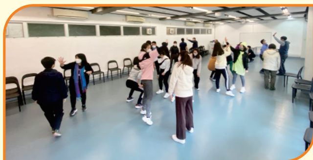
Staff Development Day (2) Adventure Training Activities