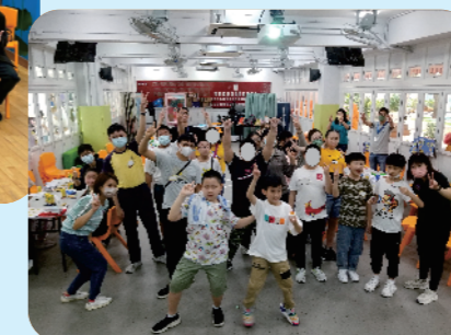
Reunion of the mentors and students under the Child Development Fund. It was an enjoyable day with games and sharing sessions