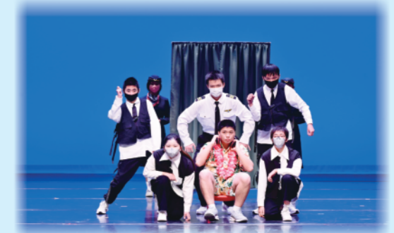
A guy enjoying his flight while the weather turned volatile and risks fast approaching

The duet "Here Comes the Sandman" is an affective and rhythmic dance piece. Well-coordinated and vivid, the performance was highly regarded among the judges. "Fantasia of the Horrific Nine Nights" was an ensemble that displayed tacit movements. It was both artistic and visually intriguing.