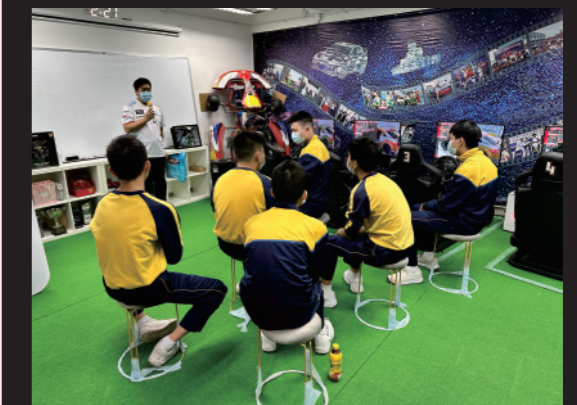
Instructors explaining the theory and skills of racing