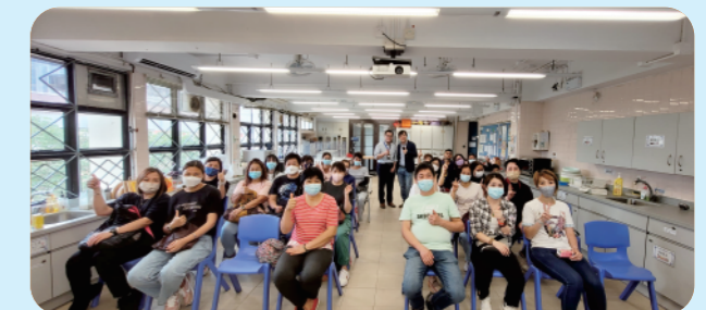
First talk organised in March for parents. The expressive speaker attracted an attentive crowd