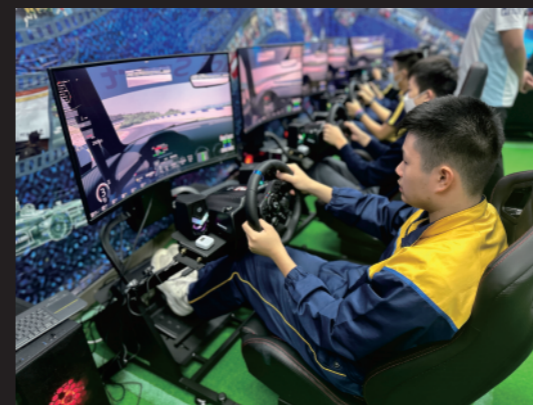
Team members doing track training

Our eSports team has been learning and practising attentively. Training aside, they have also been learning team-playing skills under the instructions of the course social worker. The team will be competing in a public tournament in August; we wish them good results!