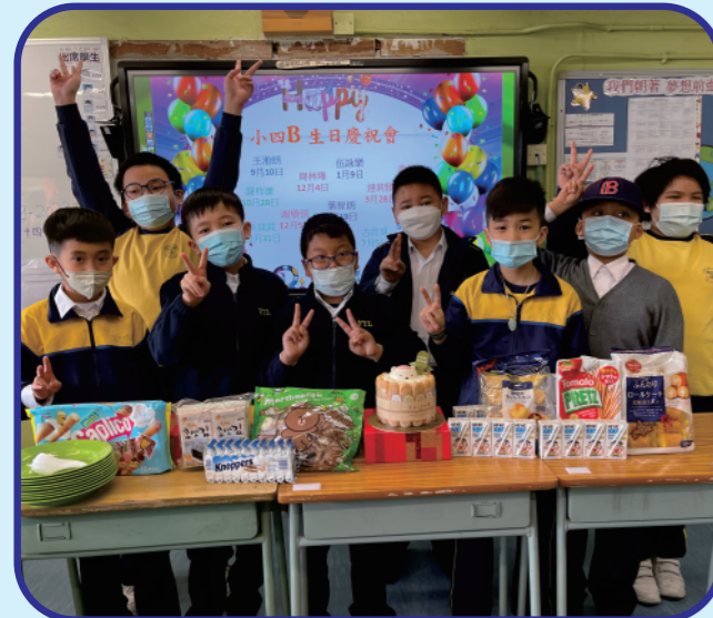
Birthday parties are long overdue