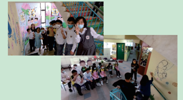
Key Stage 2 students making mural painting