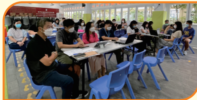
Staff Development Day (1) Preparation for External School Review