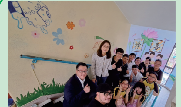
Group photo at the convening ceremony for the mural painting