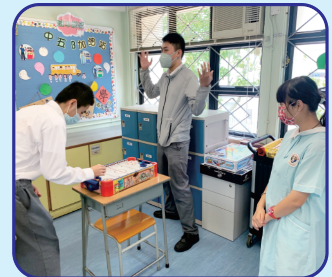
Laughter in the class