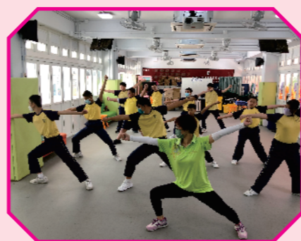
Students performing well at learning the "Five Figurative Forms" in martial arts