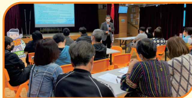
January Assessment Theory and Assessment Literacy Workshop